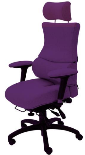
SD3 High Back with Headrest

Each chair is designed in a modular fashion to ensure each key area of the spine receives optimal support. The unique features are: