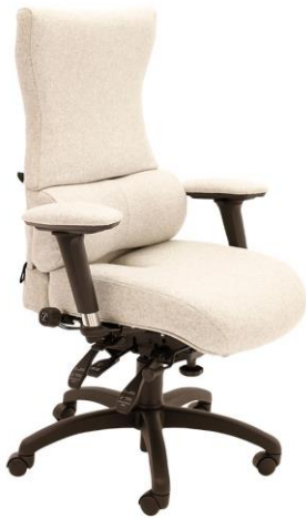
SD1 Extra High Back