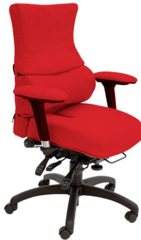
SD2 High Back