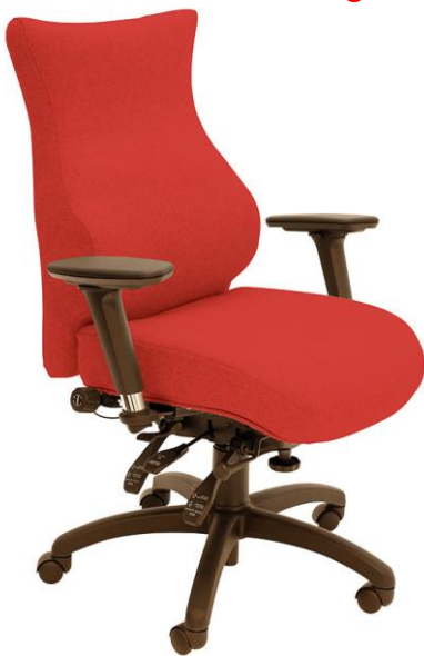
SD4 High Back Model

Designed in a modular fashion ensuring each key area of the spine receives optimal support. The unique features are: