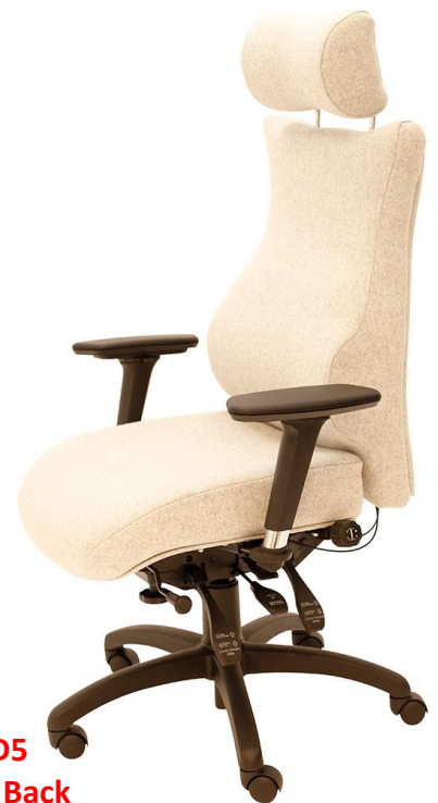
SD5 High Back With Headrest